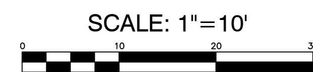
RIDGEFIELD ROAD INTERSECTION INTERIM IMPROVEMENT 2